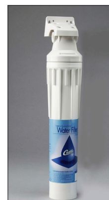
CSC15 - Water Filter