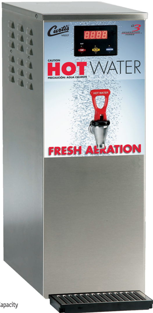
WB5GT 5 Gallon Capacity