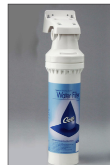
CSC10 - Water Filter

** Shipping Weight and Cube are per cases of 6.