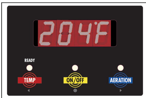
Large LED Display - 140°F - 210°F