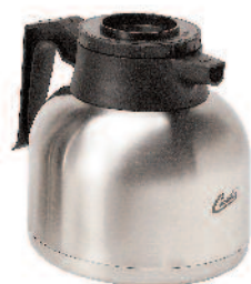
ThermoPro™ CLXP64 (Sold separately) 64 oz. stainless steel pour pot server

*ThermoPro pour pots NOT included. **Water Filtration Device Recommended.