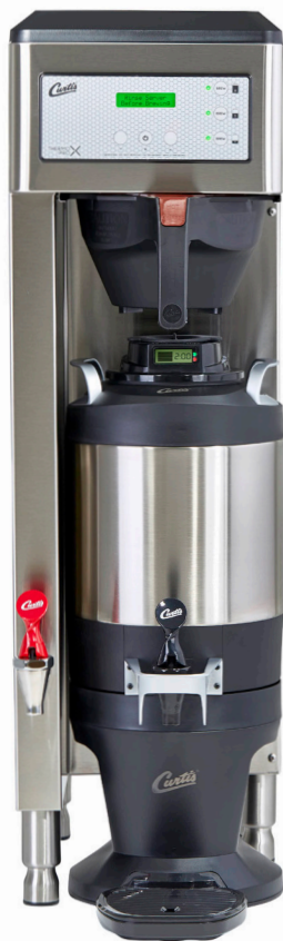
TPX2S63A3100 G3 Single 1.5 Gallon Brewer (Dispenser sold separately)