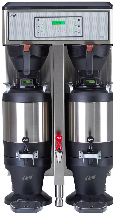
TPX2T10A3100 G3 Twin 1.5 Gallon Brewer (Dispensers sold separately)